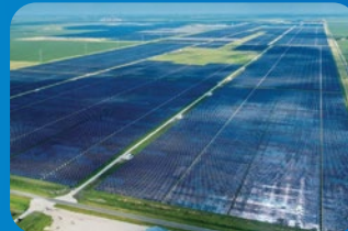
Double Black Diamond Solar