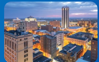
Downtown Springfield & Mid-Illinois Medical District Master Plan Completion