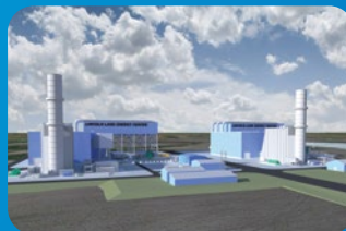
Lincoln Land Energy Center