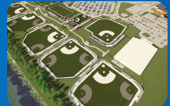
Scheels Sports Park at Legacy Pointe