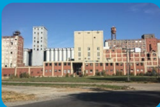
Pillsbury Mills Redevelopment