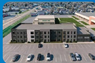
Larkspur Apartments at Town and Country