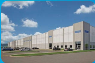
Frito-Lay Warehouse / Distribution Center