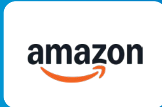
Amazon Warehouse / Distribution Center